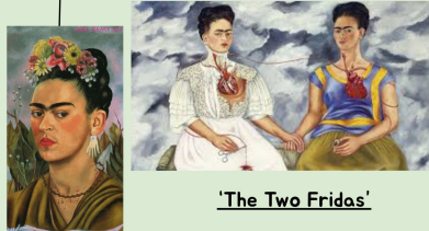
'The Two Fridas'